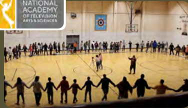
Peaceful as the Buffalo WINNER: LONG-FORM NONFICTION

Regional Student Production Award • NATAS, NW (2022)