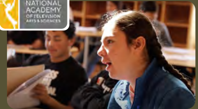
Amp Ska Pi Pikuni • Nizi Puh Wah Sin (Southern Blackfeet • Real Speak)