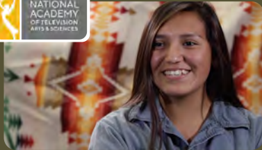
Waking the Generations WINNER: LONG-FORM NONFICTION

Regional Student Production Award • NATAS, NW (2022)